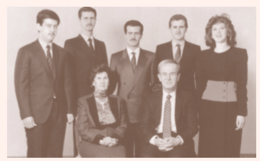
The Assad family, 1993. Wikimedia Commons.

on three main features: the already-discussed new satellite technology, allegorical disguises for critical content, and, perhaps surprisingly, the censors' purposeful permission of political criticism in the media.<sup>24</sup>